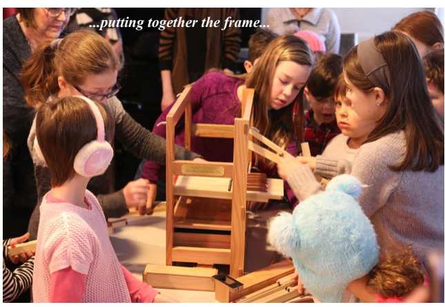
The children immediately get the idea and dive right in...